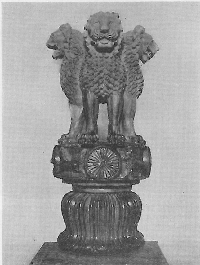
Lion carvings on the capital of one of the columns on which the Indian Emperor Asoka had carved edicts, some of which stand among the earliest conservation rulings.

Later, inspired apparently by the astute Chanakya, who afterward became his chief minister and wrote a book on the government of empires, the youth fought his way back to power. Eventually he seized the throne of Magadha in the Ganges valley, then the premier state of India, and, as Chandragupta, became India's first historic emperor. Thus he was in a position to confront the Greeks, whom, in 327 B.C., Alexander of Macedonia had led into the valley of the Indus. So successful was Chandragupta as a warrior, so terrible were his great battalions of fighters mounted upon elephants, that he not only drove Alexander's successors beyond the confines of India proper, but, through a treaty with Seleukos Nikator, he obtained possession of much of the lands that are today included in Afghanistan, Baluchistan, and Makran. He was ap-