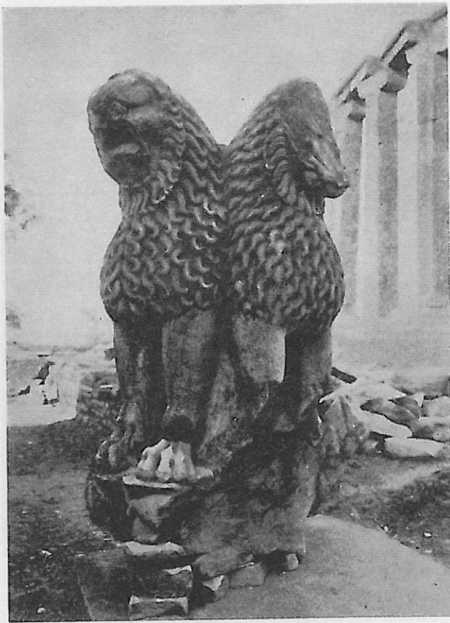
Another lion motif on a capital crown. Asoka's edicts were carved on great columns of polished limestone.

delight in the chase. But during or directly after the conquest of Kalinga, he responded to the influence of Buddha's teachings. It is difficult to trace, through the mists of so many centuries, the stages in his spiritual awakening and growth; but by his own admission his experiences during the bloody conflict brought about a complete change in moral values and opened his heart to the benevolent doctrines of Gautama Buddha, who had lived and taught in Magadha two or three centuries earlier. At the conclusion of the Kalinga war, the Emperor became a Buddhist lay disciple, and after a novitiate of about two and a half years entered the Buddhist Order as a monk, although he continued with great energy and efficiency to administer the affairs of his vast domains. Such a combination of monkish devotion with regal duties is by no means unique in the annals of ancient India and China.